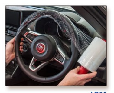
Steering wheel protection Autowrap cling film

All our seat covers have been successfully tested for seat air-bag deployment by Millbrook Proving Ground