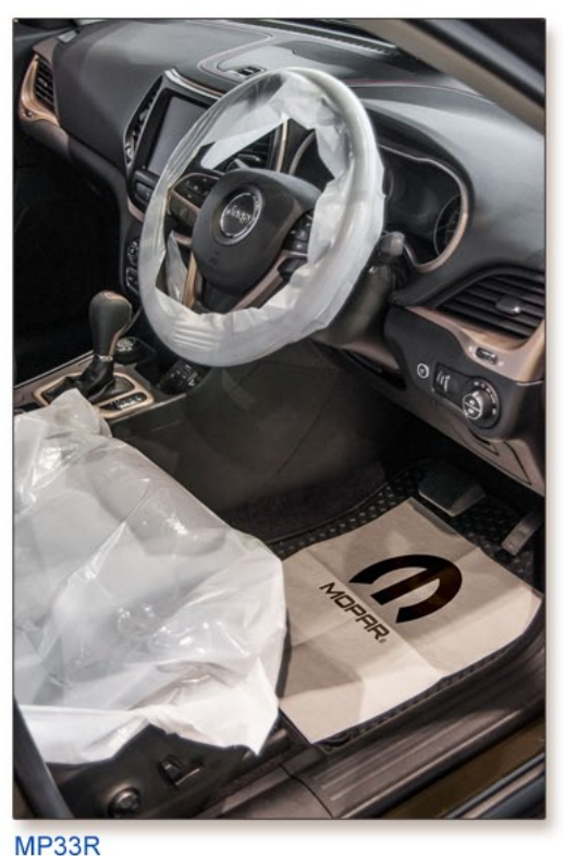
Mopar printed white crepe floor mats -500 per roll