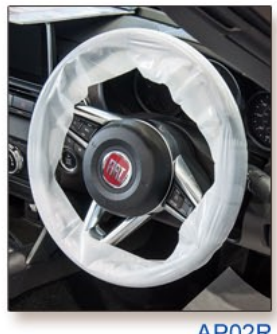
Steering wheel protection white plastic - 500 per roll