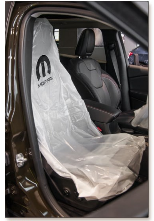
MP01R Mopar printed single use disposable seat covers - 500 per roll